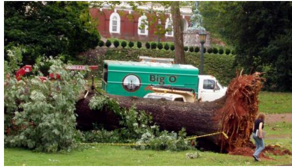
Figure 8.1. Unbalanced trees.

The depth of the output tree should be no higher than \log_2 n + 1 where n is the number of elements in the input tree.